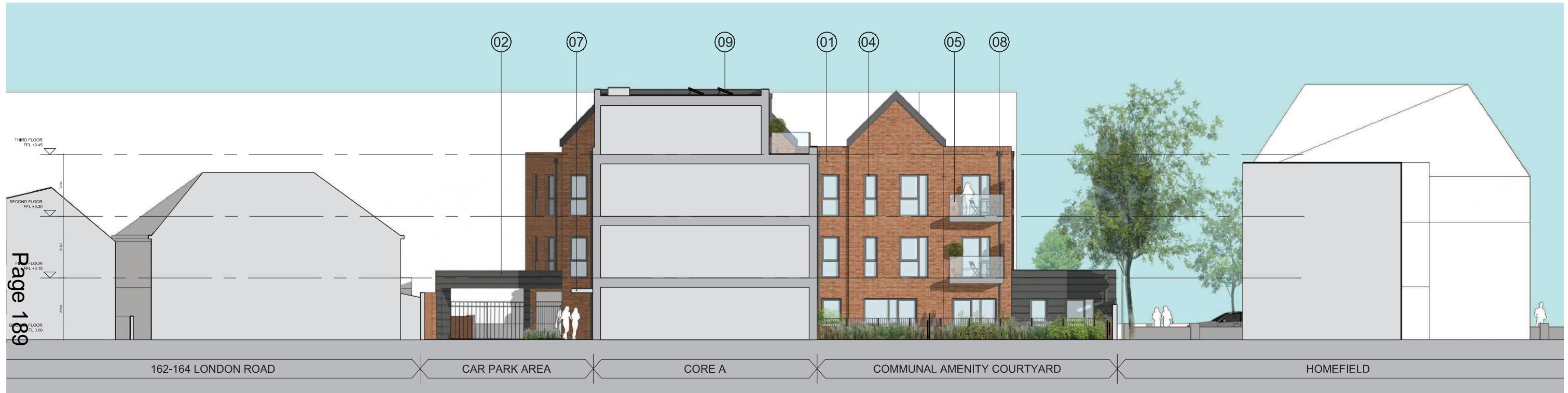
SOUTH-EAST COURTYARD ELEVATION